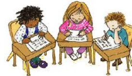
We Are Authors!

We are working on writing Small Moment Stories. The children first have to generate ideas for stories to write that they feel very strongly about. These stories are true from their own lives. We plan our stories by touching each page before we begin to sketch. Then we sketch our pictures and last we add words to go with our stories. We have to reread our stories so that they make sense, they sound right and look right. You can help your children in writing by telling stories at home. Storytelling is a great way for students to practice saying their stories out loud, which makes it easier to plan, sketch, and write.