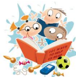
We Are Readers!

In Reading we are working on word solving skills in several ways. The children will become Word Detectives and will be learning how to solve tricky words in various strategies. The most important goal will be to make sure your children are active problem solvers. Please remember to always read with your children and Talk, Talk, Talk about the books they read.