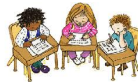
We Are Authors!

In Math we have been playing a lot of Math Games. These games help students with number recognition, counting on, counting back, and comparing numbers. We will be sending home games throughout the school year. Please be mindful of the games sent home because we may revisit them throughout the year. It's going to be a fun filled year with numbers!